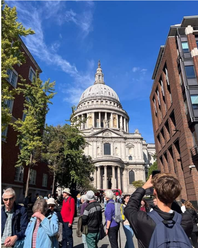
Setting off from St Paul's