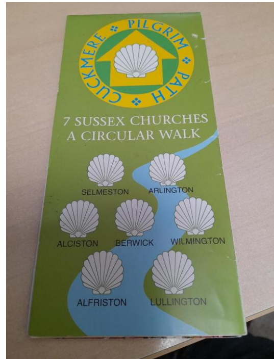
Cuckmere Pilgrim Path

the catastrophic fire which destroyed much of the old city over five days in September 1666. We completed the two-mile walk, which was packed with historical interest, in time to attend a memorable Sung Eucharist under the dome at St Paul's Cathedral, and then enjoy a pizza before heading home.